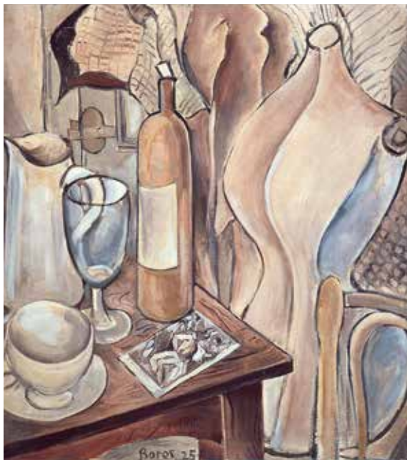
The pink mannequin , 1925. Museum of Contemporary Art of Madrid.