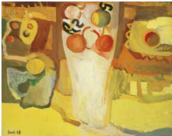
Les fruits rouges [The red fruits], 1967. Private collection

blues and different hues of green. They are still lifes full of puppies, flower vases or fruit bowls with a marked evocative sense. Bores simplifies the expressive resources to an extreme and favours a higher degree of plasticity, whereas the chromatic value contrast is able to create a sense of spatiality.