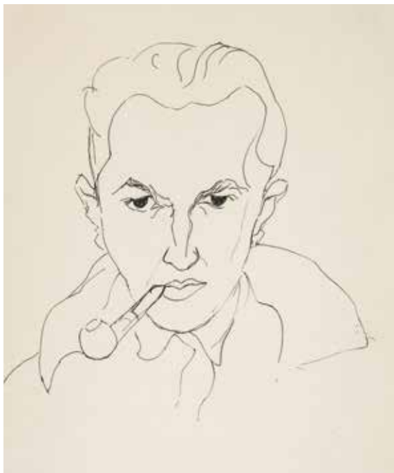
Untitled [Self-portrait with pipe and raincoat], c. 1925. Residencia de Estudiantes, Madrid.