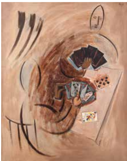
Untitled [Card Players], 1928. Private collection