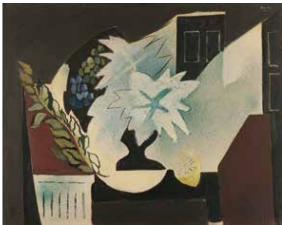
Nature morte [Still life], 1926. Private collection