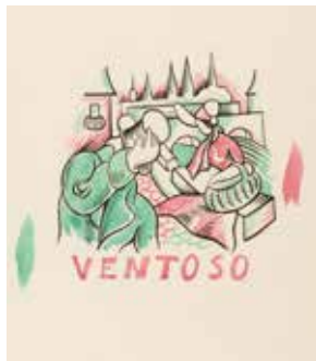
Pluvioso and Ventoso , original strips for the cover of the Revista de Occidente , year III, issues XX and XXI, Madrid, 1925. Residencia de Estudiantes, Madrid.