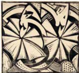
Soccer players and Dancers , c. 1922. Residencia de Estudiantes, Madrid.