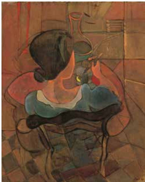
Jeune fille buvant une citronnade [Girl drinking lemonade], 1934. Private collection

Towards the end of 1930, Bores discovered the light of Provence thanks to a sojourn in Grasse. “I felt captivated by the light, by the fruit, by the women in that region and I started to paint landscapes and figures again, trying to restore the extraordinary brightness of the world to my