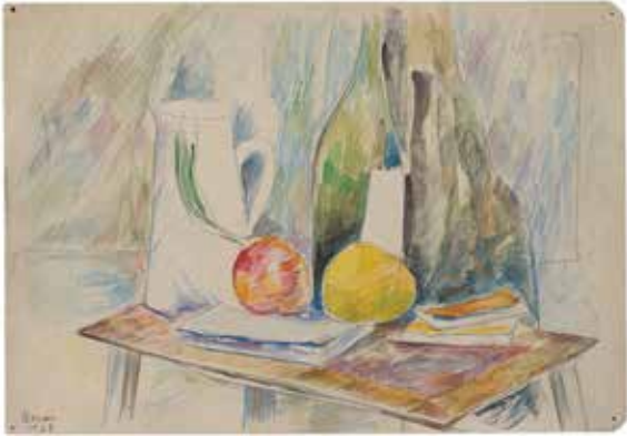
Still life , 1923. Residencia de Estudiantes, Madrid.