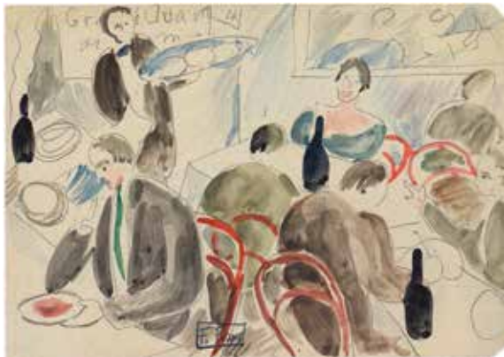
Dinner in a cafe , c. 1923. Residencia de Estudiantes, Madrid.